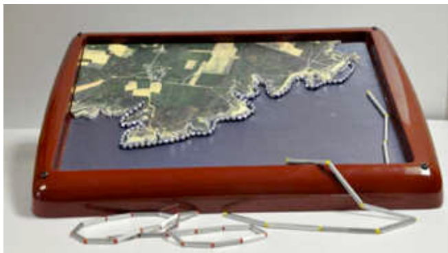
The "Fractal Coasts" module