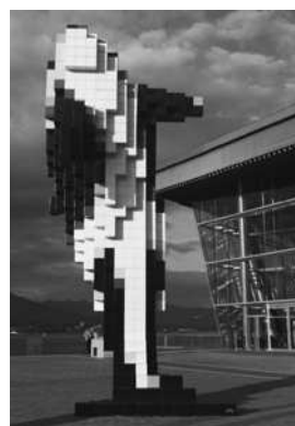
The orca sculpture outside the conference centre.