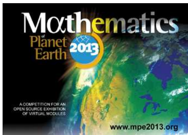
Logo of the Mathematics of Planet Earth Initiative