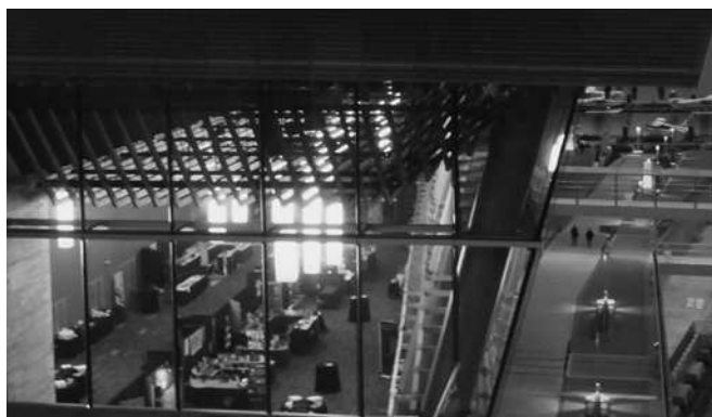
The conference centre at night, showing the grassy roof on top and the book exhibition within.

If it wasn’t enough to host the Winter Olympics in 2010, Vancouver in 2011 saw the influx of nearly 3000 mathematicians from over 70 countries to attend the 7th International Congress on Industrial and Applied Mathematics (ICIAM 2011). A splendid new conference centre