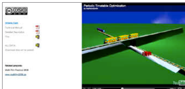
Time table optimization

The 2005 timetable for this network was computed by Matheon at the Institute of Mathematics at TU Berlin. The key was state-of-the-art combinatorial optimisation