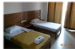
State of the art guesthouse