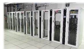
Turing Computing Centre