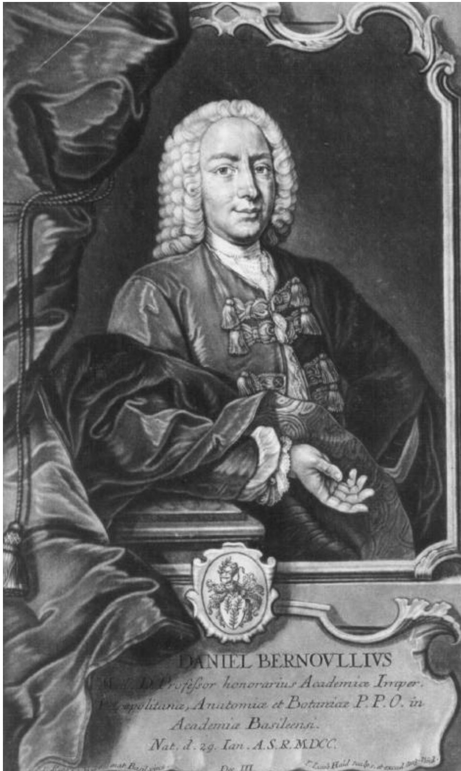
Figure 1. The portrait of Daniel Bernoulli aged 44 honouring his status as Professor of Anatomy and Botany in the medical faculty at Basel.